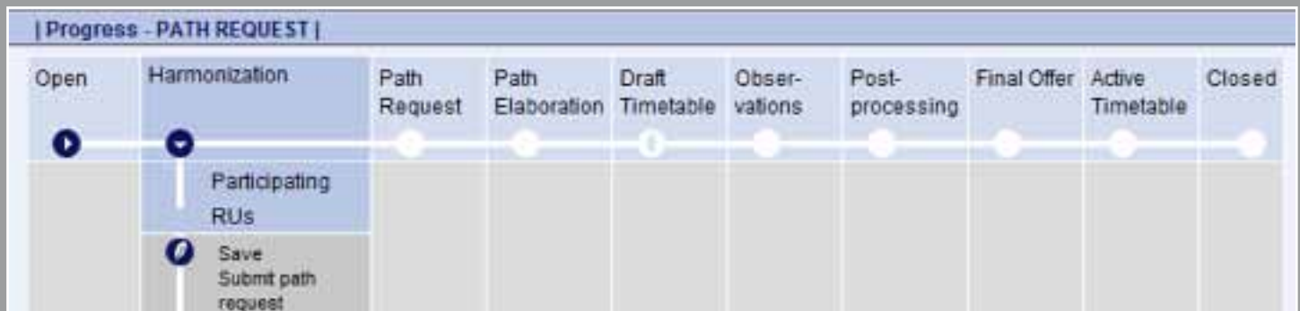
Pathfinder and Timetabling Process

Pathfinder is an international path request coordination system for Railway Undertakings (RUs) and Infrastructure Managers (IMs). The internet based application optimizes the international train path coordination by ensuring harmonized path requests and offers between all involved parties. Input for international path requests needs to be placed only once into one system - either into the domestic application or directly into Pathfinder.